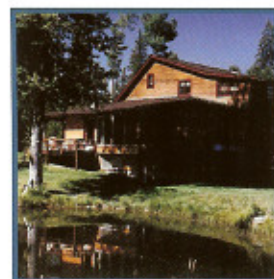
Galena Ridge base camp.

Many of our summer students transfer to the 20 PEAKS RANCH residential program from September through May. This program is a follow-up to the Galena Ridge program and offers academics in public school, extracurricular activities, and a structured living environment with continued counseling support.